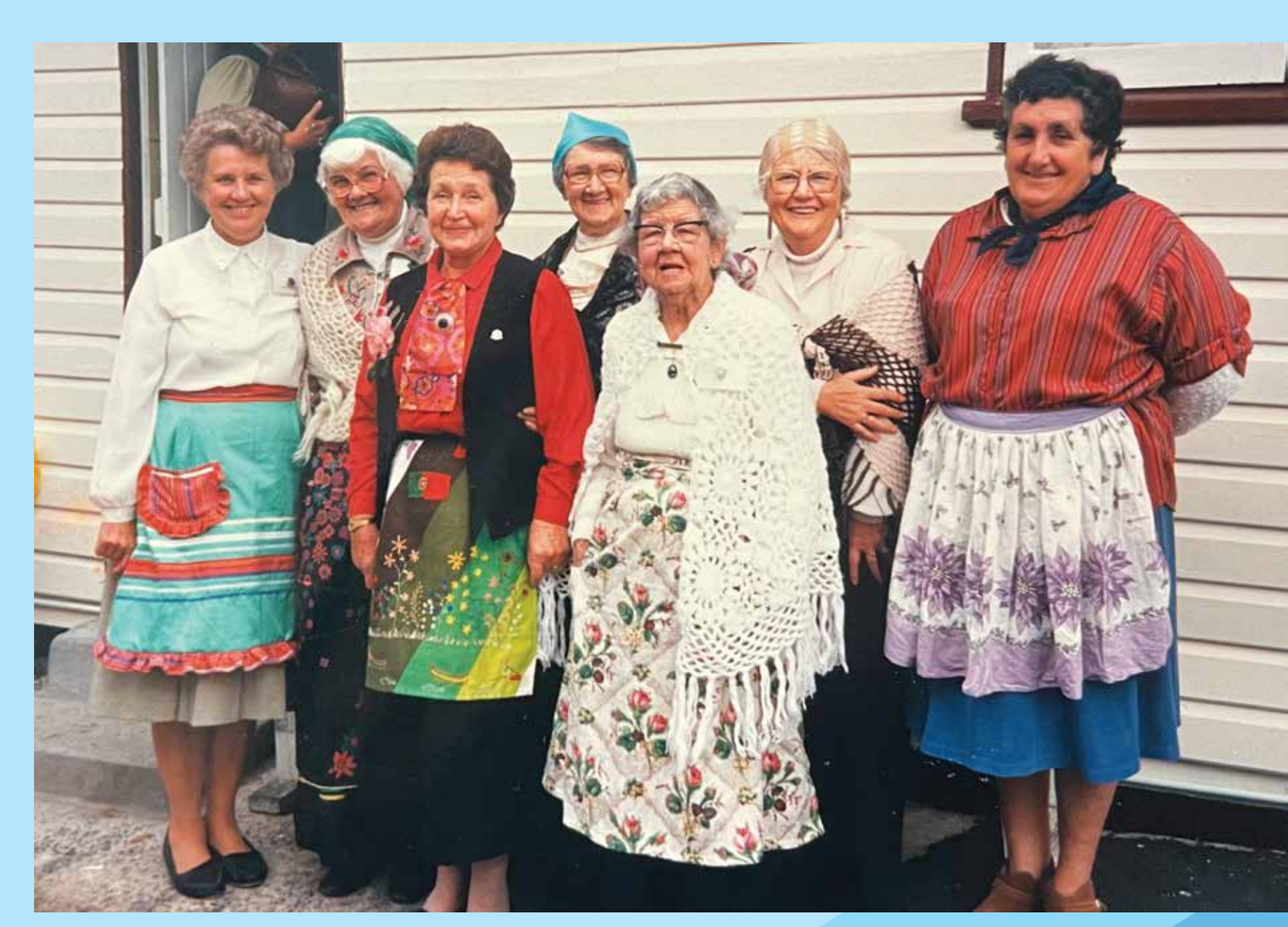
CWA Country of Study Portugal

currently used for community activities today.